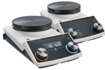
HEI-PLATE CORE AND CORE+