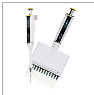
Tacta® Pipettes Flow your work with robust and accurate pipettes, tips and bottle top dispensers.