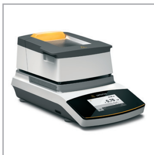
MA160 Moisture Analyzers Specify mass and moisture content of your samples using super-fast moisture analyzers.