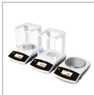
Quintix® Balances Choose from a range of intuitive lab balances to get the best weighing results and optimized workflows.