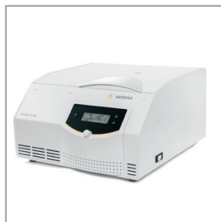
Centrisart® Centrifuges Remove coarse fiber material in an easy and economical way.