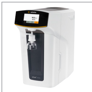
arium® Lab Water Systems Use ultrapure water to prepare your samples and run your chromatography tests.