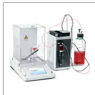
Cubis® MSA Dosing System Simplify your workflows with the automatic preparation and documentation of 100% comparable analytical standards for Cannabis testing.