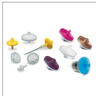
minisart® Syringe Filters Simply and safely remove solids from your sample with syringe filters.